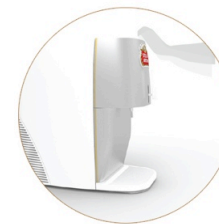
STEP No 2: COOL