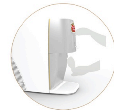
STEP No 3: SERVE