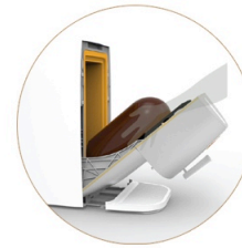
STEP No 1: INSERT & CONNECT